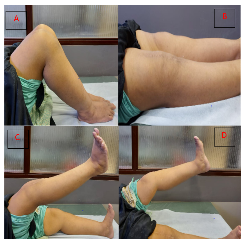
Fig. 3 a. Maximum flexion of both knees 6 months after surgery. b. Full extension. c. Active straight leg raise test on the right leg. d. The same test on the left leg

lqbal et al. Arthroplasty (2021) 3:5 Page 4 of 5