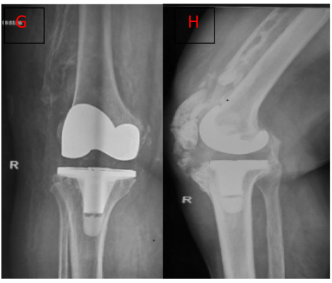
Fig. 2 Postoperative AP view of right knee showing the result of cemented total knee arthroplasty (TKA). b AP view of left knee showing the result of cemented TKA. c . Lateral view of right knee. d Lateral view of left knee. e AP X-ray showing HO on the lateral aspect of distal femur 3 months after TKA. f Lateral view showing HO extending from the tibial tubercle to the proximal tibia. g Postoperative AP view of right knee showing HO on the lateral aspect of distal femur. h Lateral view of right knee showing severe HO on the anterior aspect of distal femur

[4, 5]. HO rarely affects knee function. Therefore, this complication does not attract the attention of knee surgeons [6]. The risk factors for HO formation include male gender, obesity, excessive manipulation and extensive soft tissue dissection during surgery, ankylosing spondylitis, previous injuries to the knee, rheumatoid arthritis, early septic arthritis, preoperative knee deformity, increased lumbar bone marrow density, etc. [2, 7] In this case, the patient had severe varus deformity of both knees. Therefore, extensive soft tissue dissection had to be performed intraoperatively to achieve a rectangular gap for soft tissue balancing. The procedure might be the contributing factor to the HO formation, especially in patients with rheumatoid arthritis [8].