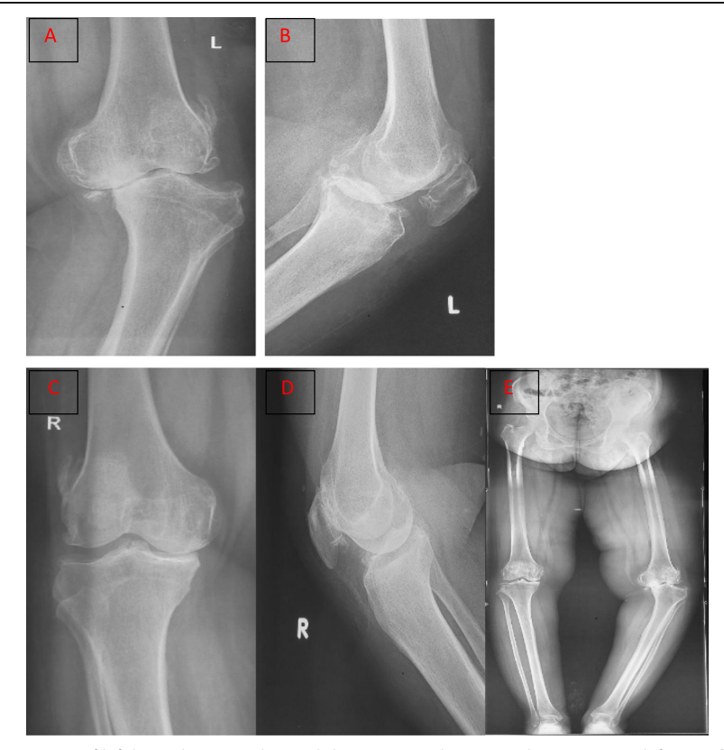
Fig. 1 a. Anteroposterior (AP) X-ray of left knee showing advanced degenerative changes and severe varus deformity. b Advanced degenerative changes on lateral view. c Degenerative changes on AP view of right knee. d Lateral view of right knee. e Full-length standing scanogram showing bilateral varus deformities, which were more severe on the left side

HO after total hip arthroplasty is a common complication, but new bone formation after primary TKA is a rare event, and their clinical association is still unknown